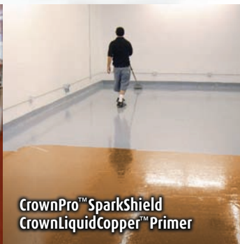
CrownPro™ SparkShield CrownLiquidCopper™ Primer